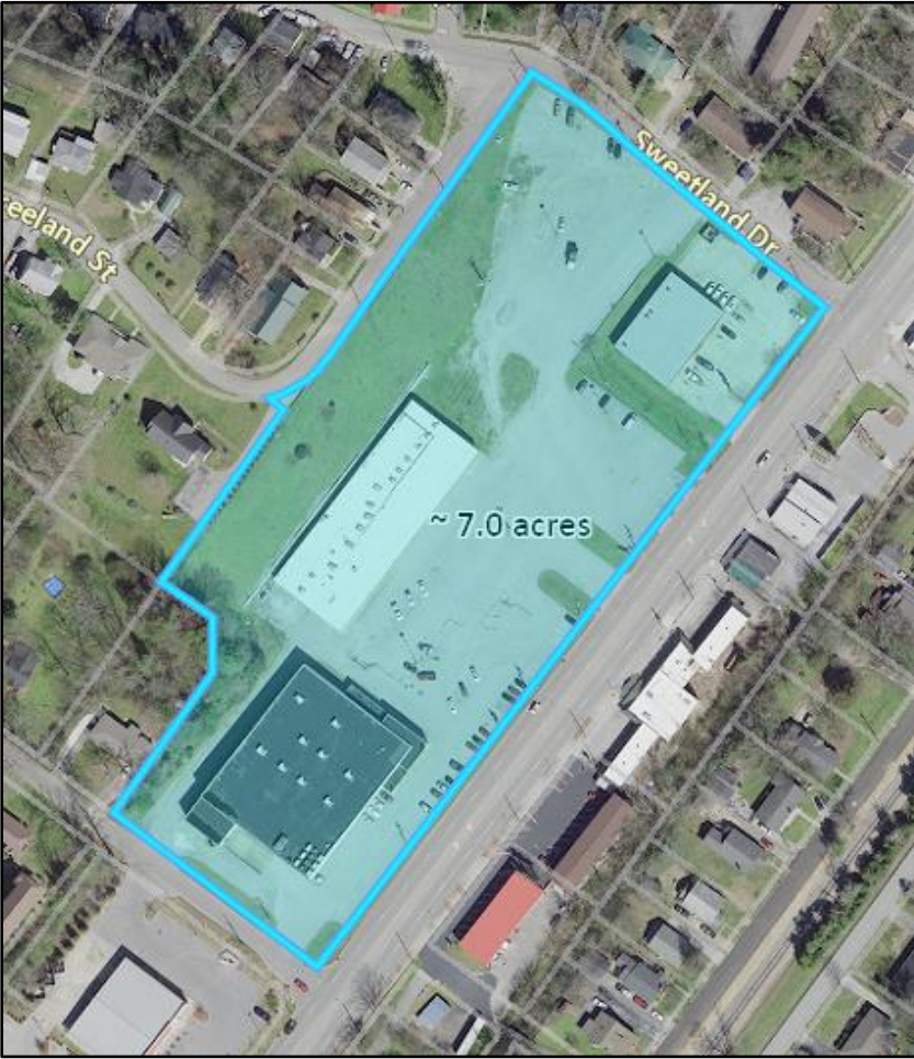
2101 Dayton Boulevard ~ 7.0 acres