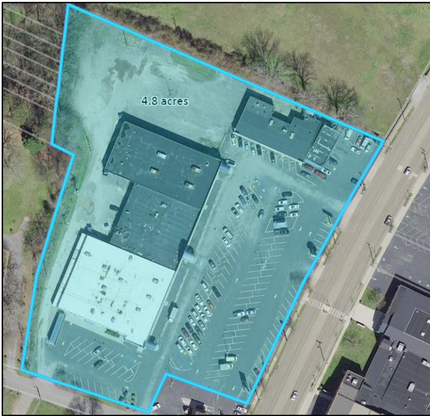
3605 Dayton Boulevard 4.8 acres